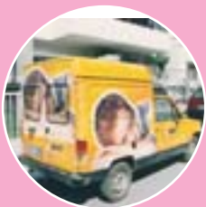
Creative applications with Sirocco 1080